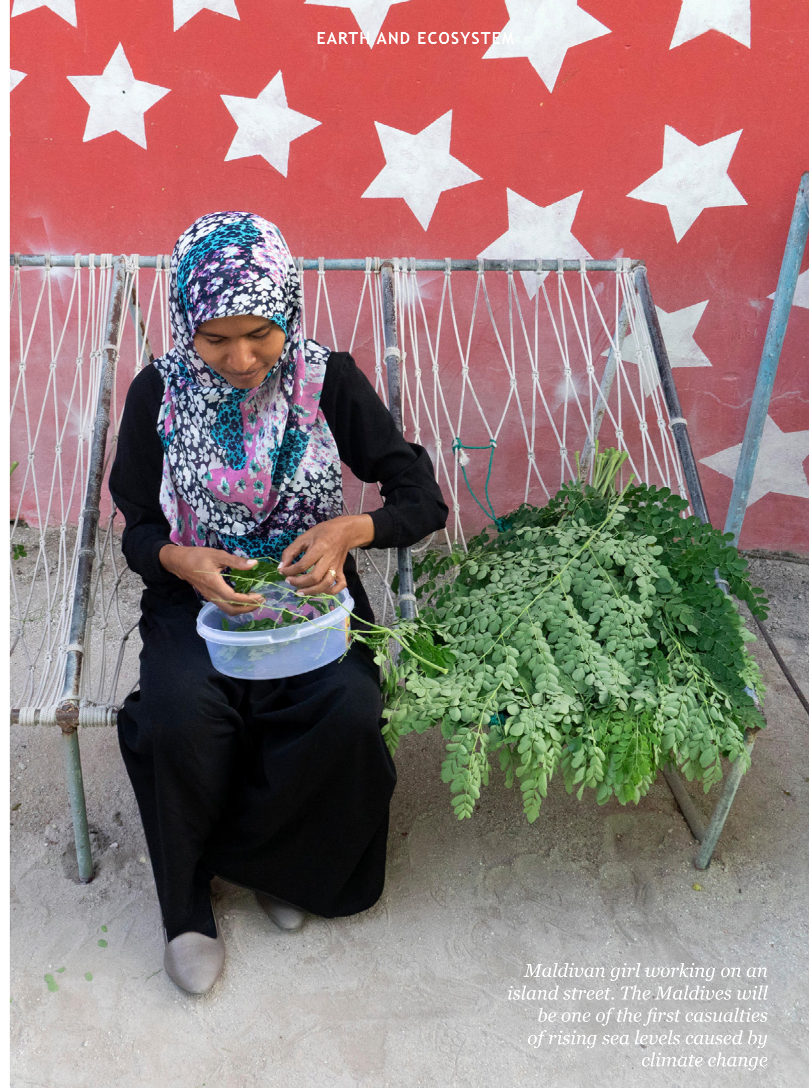
Maldivian girl working on an island street. The Maldives will be one of the first casualties of rising sea levels caused by climate change

Just before COP26, the CFB/Epworth joined 71 other faith institutions in a joint announcement on fossil fuel divestment. JACEI noted that this announcement sent a powerful message company, political, and faith leaders – demonstrating the CFB/Epworth position that until such time the oil and gas companies take the emergency seriously and align with the COP accords, they cannot form part of an ethical portfolio.