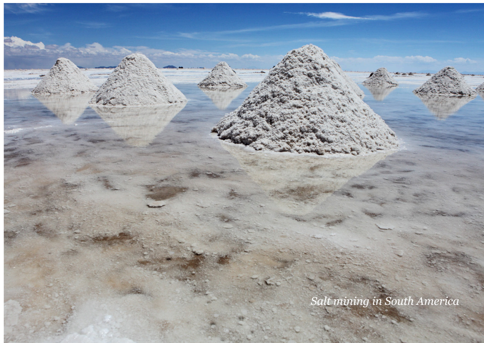
Salt mining in South America

The CFB/Epworth continues to monitor and engage with the bank on this topic.