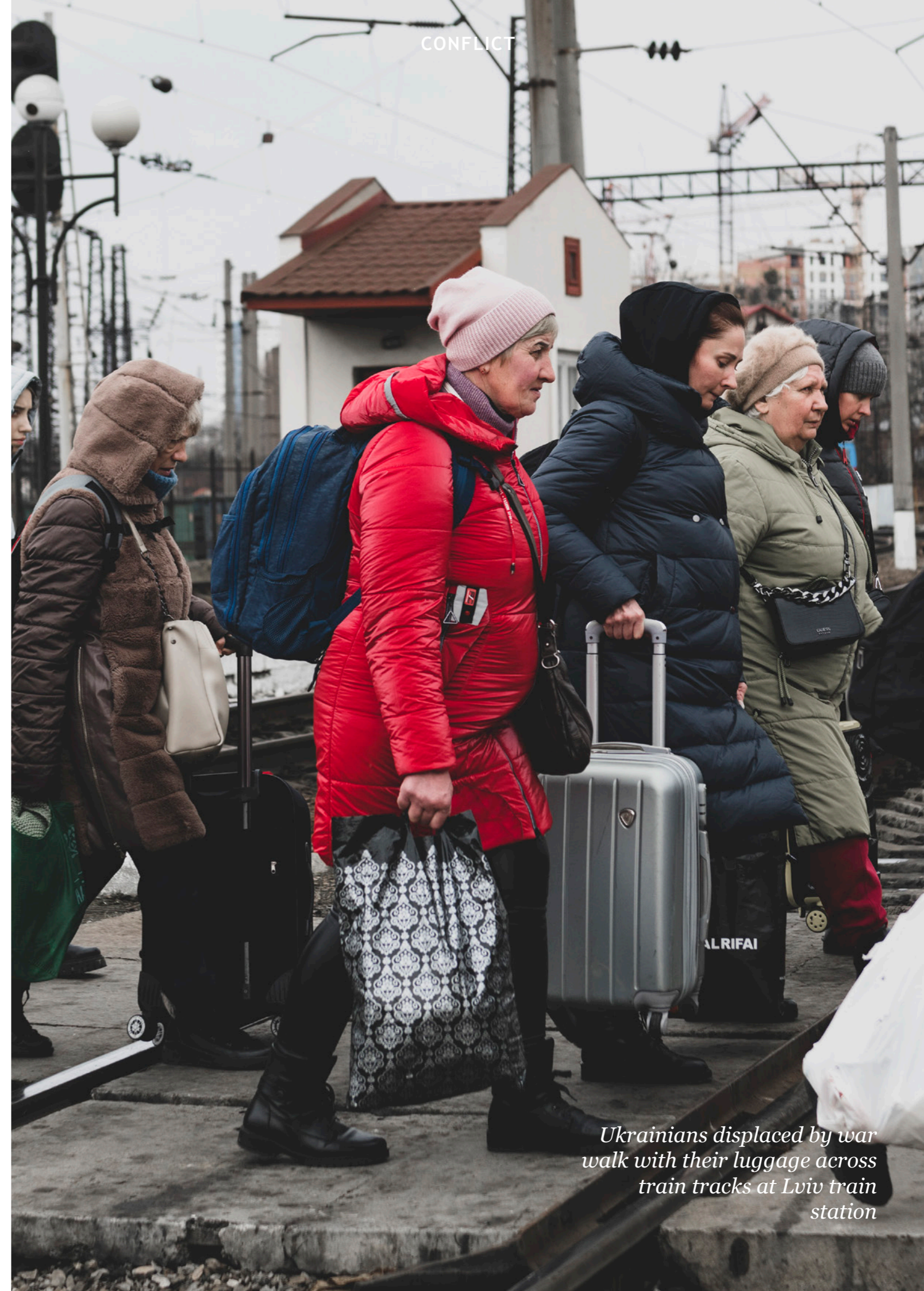
Ukrainians displaced by war walk with their luggage across train tracks at Lviv train station

In accordance with the published schedule, a robust review was undertaken, and it was determined a new policy should be drafted to better represent the challenges facing the region. After consultation with subject matter experts and a detailed examination of data and in-country testimony, a new policy was drafted. At the December 2021 meeting of JACEI, the new policy was approved and subsequently published on the CFB website- fulfilling the request of the Methodist Council.